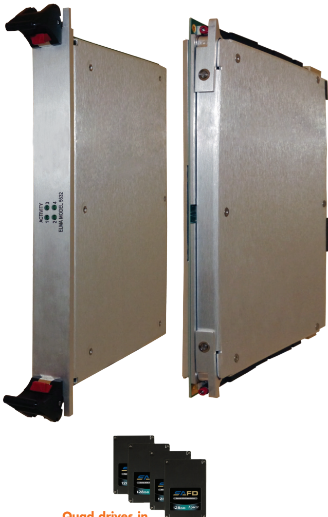
Quad drives in one 6U VPX slot