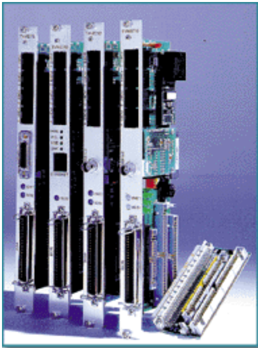
ACT/Technico's family of Transition Modules

An innovative and cost-effective single slot solution with Ethernet and Fax/Modem options.